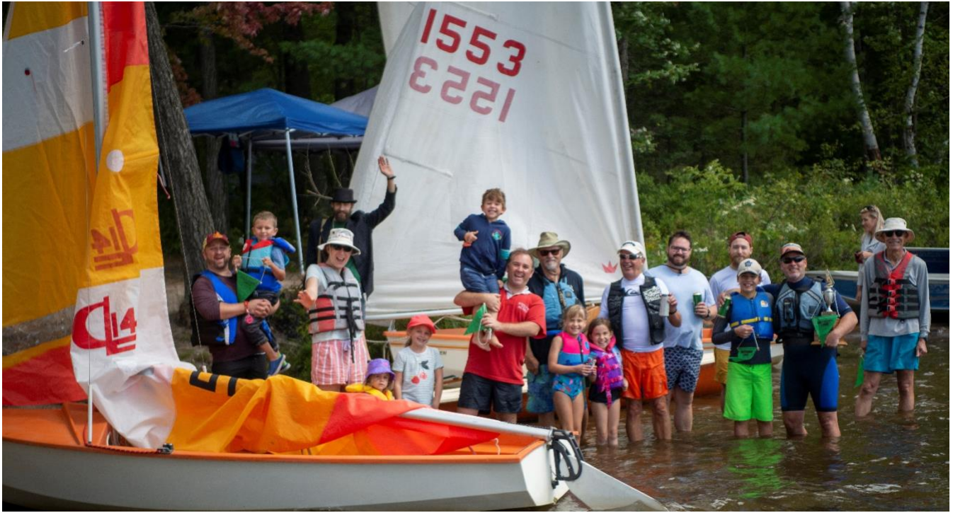
Sailing Race 2020